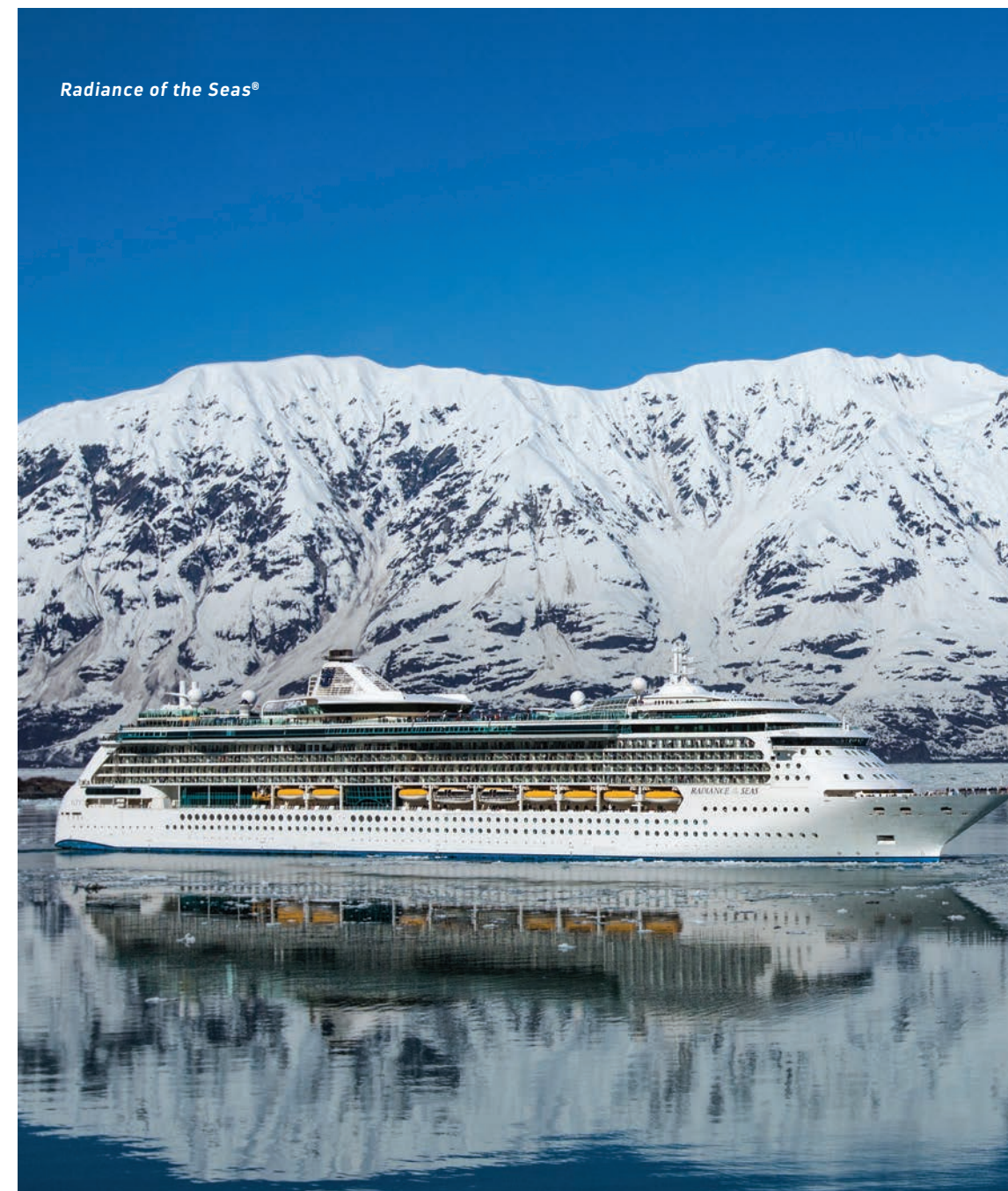
Radiance of the Seas®

KIDS AND TEENS — The award-winning Adventure Ocean® Youth Program delivers games, events, educational activities and more for kids ages 3 to 11. And teens get their own places to chill, plus activities from games and sports to karaoke and dance parties.